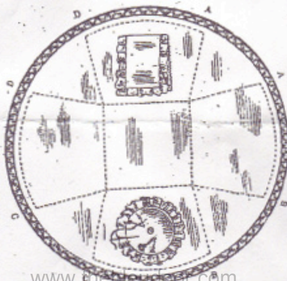
Intérieur de la corbeille.